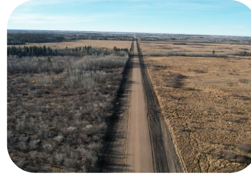
Twp Rd 570 Local Road Reconstruction