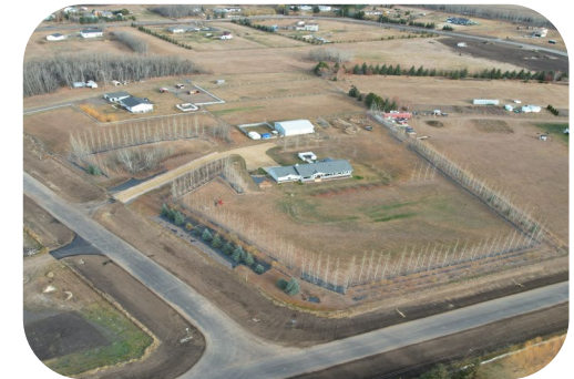
Woodridge Subdivision Subdivision Surfacing Program