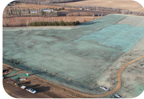
Waterdale Park Open Spaces Program