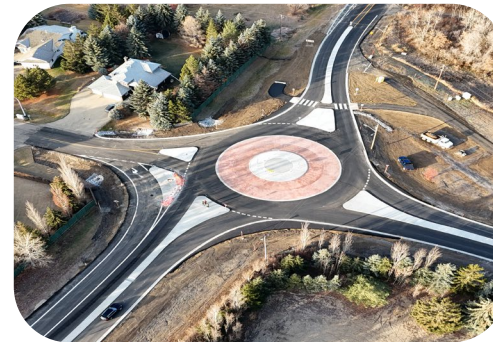
Sturgeon Road Roundabout Intersection Program