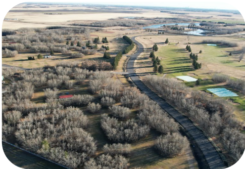
Cardiff Park / Rge Rd 251 Rehabilitation Program