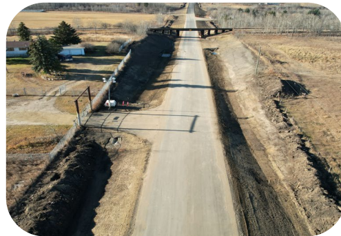
Twp Rd 564 Rehabilitation Program