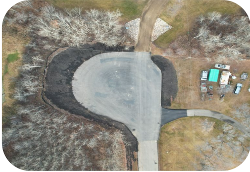
Sturgeon Valley Vista Surfacing / Pavement Preservation Program