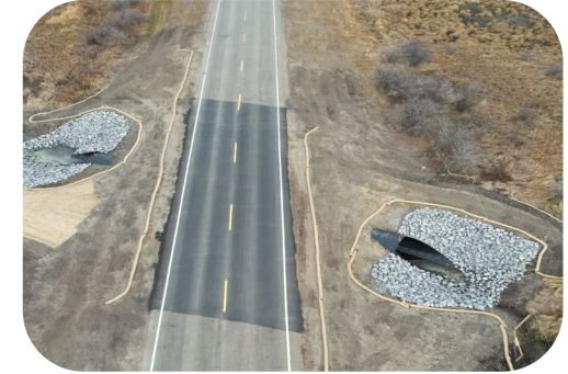
Bridge File 78067 Bridge Program